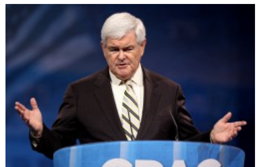
Newt Gingrich is a recent geoengineering advocate.

A number of commentators have pointed to the existence of a “geoengineering clique” that is promoting the technofix