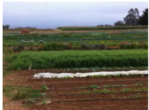
Agroecology practices are one of the most effective ways to reduce climate change.

Real, fundamental, low- to no-risk, beneficial, long-term solutions to climate change are already available. They include agroecology, reducing emissions and resource consumption, implementing hard emissions limits, investing in public transportation and liveable and workable communities, and stopping deforestation, among many many others. The problem is not that these solutions don't work, it's that they are incompatible with any goal or mandate for an ever-expanding economy based on the exploitation of finite natural resources. Reducing emissions provokes opposition from big oil; public transportation is curbed by car manufacturers; large-scale expansion of agroecology raises the ire of industrial agribusiness conglomerates.